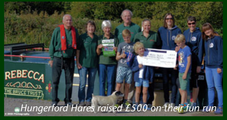
Hungerford Hares raised £500 on their fun run

An enormous thank you to all our volunteers who have helped with the boats this year – what an amazing team! Following the exciting news in the attached Trustee's letter we are, more than ever now, hoping to continue to welcome new members to our team of volunteers. If you are interested in helping us for a couple of hours on a Friday or Saturday morning at Great Bedwyn Wharf, near Marlborough, as a Team Leader, Engineer, Cleaner, Skipper or Crew members, please do contact us for more information.